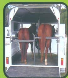
ANTI SCRAMBLE CONCEPT