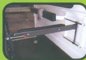
15 POSITION FULLY ADJUSTABLE HEIGHT AND BAY LENGTH CHESTBAR. PATENT NOS: 2006100106, 545349