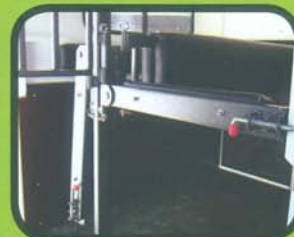
2 position adjustable drop down walk through chest bar design FEATURED IN ALL DELUXE MODELS AS STANDARD. Patent Nos: 2006100106, 545349